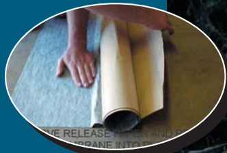
Remove &amp; Press in Place