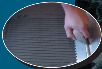
Apply Latex-Modified Thinset &amp; Install Tile