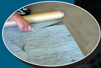
Cut to Correct Length